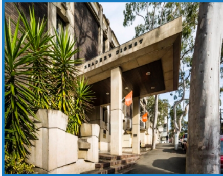
Reader's Digest Building