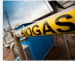
Waste-to-energy and local distributed energy generation