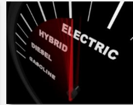
Electric and hydrogen vehicles

The CEFC is able to finance all of these technologies