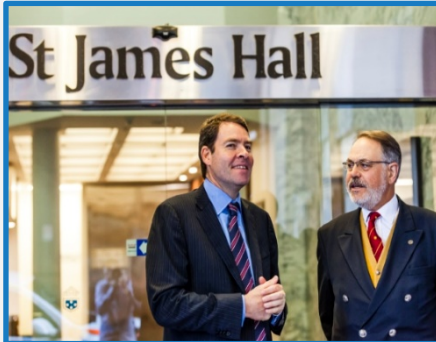
St James Hall

New air conditioning, lighting and building management systems