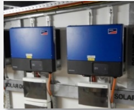
Smarter energy management