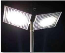
Ubiquitous LED lighting